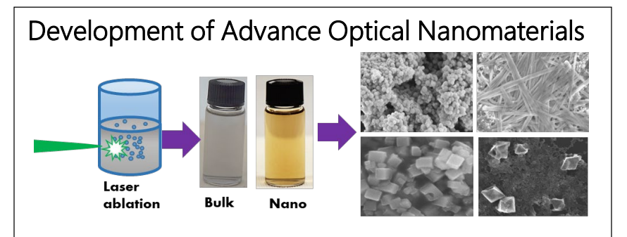
Figure (a) : Nanostructures prepared by laser ablation