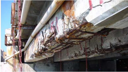
Fig.1 A concrete structure damaged by chloride attack