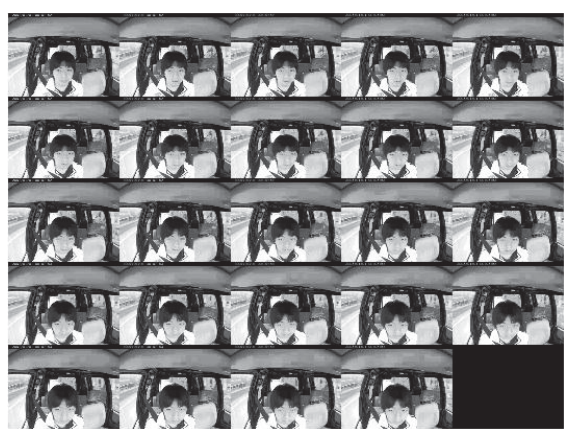
(a) Frontal face category