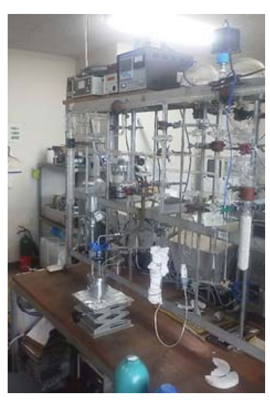
Fig. 1 Volumetric apparatus for measurement of adsorption & desorption velocity of water on adsorbents..