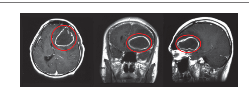
Fig. 1 Brain abscess by S. intermedius